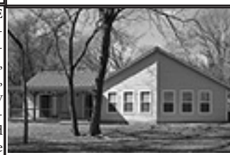
Sulphur Springs $149,900

LAKE FORK WATERFRONT HOME on 10+ acres in Dream Hills Subdivision with a voluntary HOA. Home features new carpet & paint with 5 bdrms, 3.5 baths, dining room, breakfast room, sun-room, 3 car garage, patio breezeway and an irrigation system. Plus an additional 3 car garage workshop, stocked pond with fishing pier and the large leaseback to Lake Fork is heavily wooded. Seller is ready for your best offer.