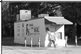
Ice House Business

LOCATED IN EMORY INDUSTRIAL PARK Formerly a doctor's office building, this custom built building features metal and stone construction. Interior has a nice lobby or reception area, multiple rooms for offices, full kitchen and 2 bathrooms with a stall shower AND living quarters upstairs. Building has a garage with receiving area and roll-up door. Call JR for detailed information.